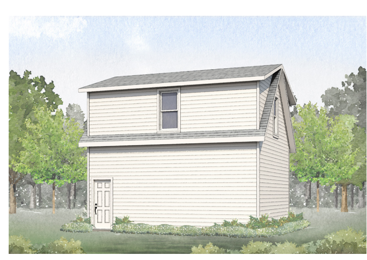
OPTIONAL UNFINISHED STORAGE 19-2 x 19-4